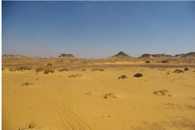
Habitat of Bubo ascalaphus 2011

Up to the present this one is the driest habitat where a Pharaoh's Eagle Owl has been found breeding by the authors.