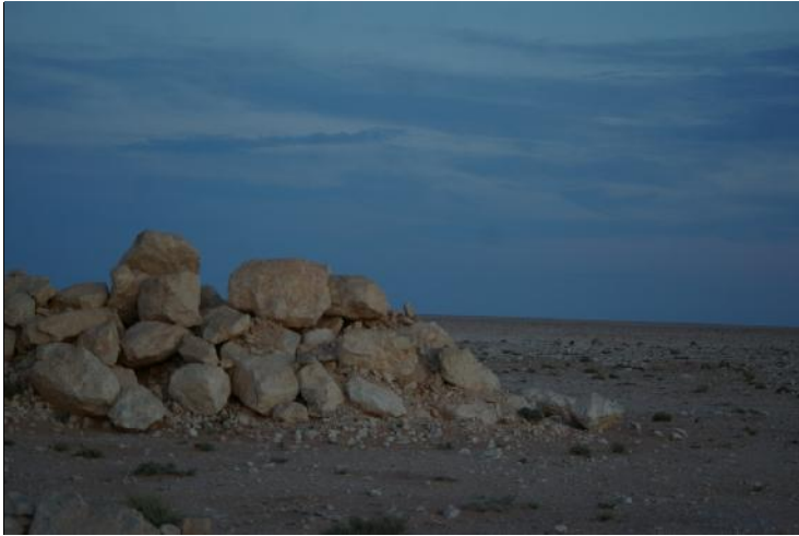
Pearching place of Athene noctua on the North Coast.

Little Owl Athenae noctua About 30 kms S of Matruh; pellets were collected; perch was in pile of large rocks (created by bulldozer) 30m off highway. Does the owl spend time there, rather near the highway, in hopes of cars stirring up insects (plants often grow near the road, due to the splash or runoff of rain from a paved road), that he can catch?