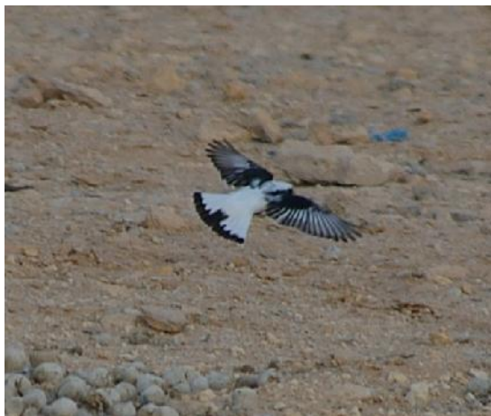
Oenanthe fichii 2011