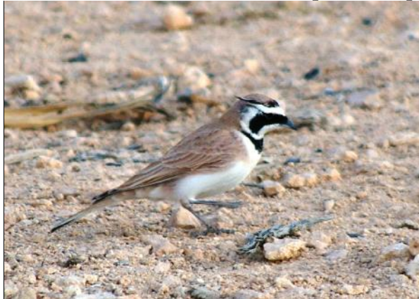
Eremophila bilopha 2011