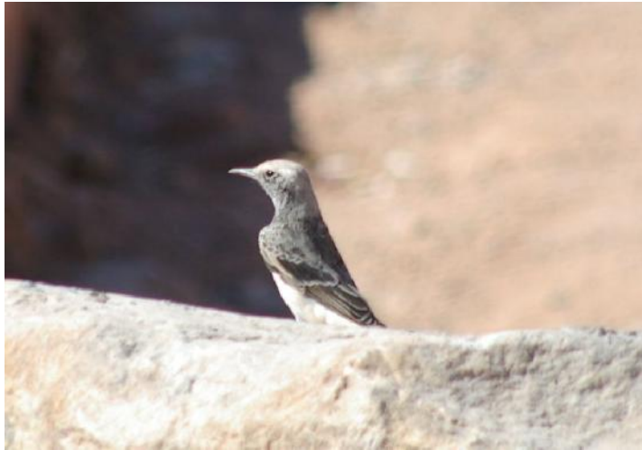
Oenanthe monacha 2011