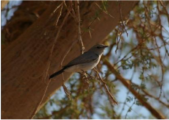
Cercomela melanura 2011

In a remote tributary of Wadi Feiran, a Hume's Tawny Owl was found and pellets were collected; they will be analyzed for contents. Territorial calls were heard only pre-dawn (0445-0509). Three individuals called from 3 different wadis.