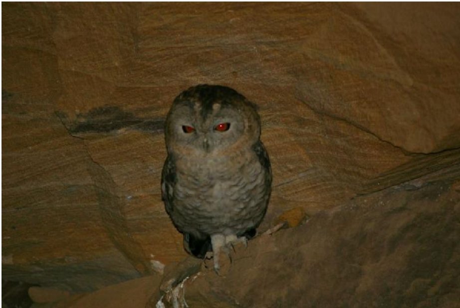
Strix butlerii 2011

In a remote tributary of Wadi Feiran, a Hume's Tawny Owl was found and pellets were collected; they will be analyzed for contents. Territorial calls were heard only pre-dawn (0445-0509). Three individuals called from 3 different wadis.