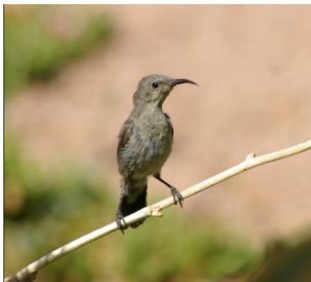
Nectarinia osea fem. 2011

Striolated Bunting Emberiza striolata One individual seen